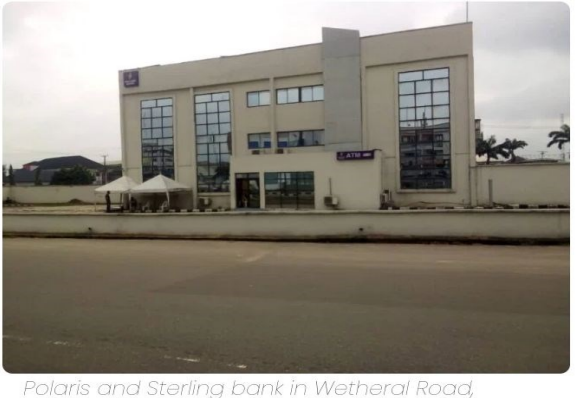
Owerricall elegad for by pipage