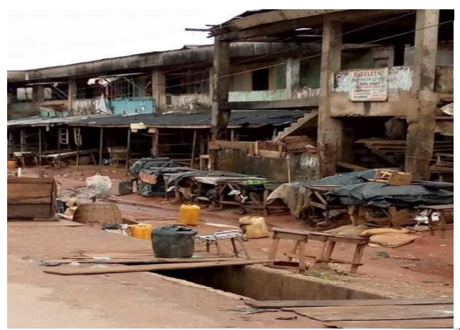
Figure 1: Markets, Shops, Banks and other SME's shutdown in different locations in the South-East During IPOB Sitat-Home Order